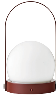
Burned Red 4864349